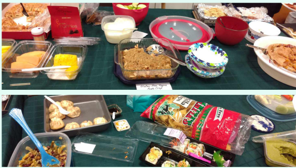
Food was a plenty