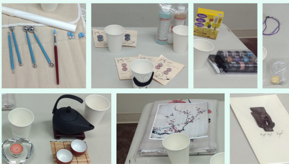
Raffle prizes were to die for!