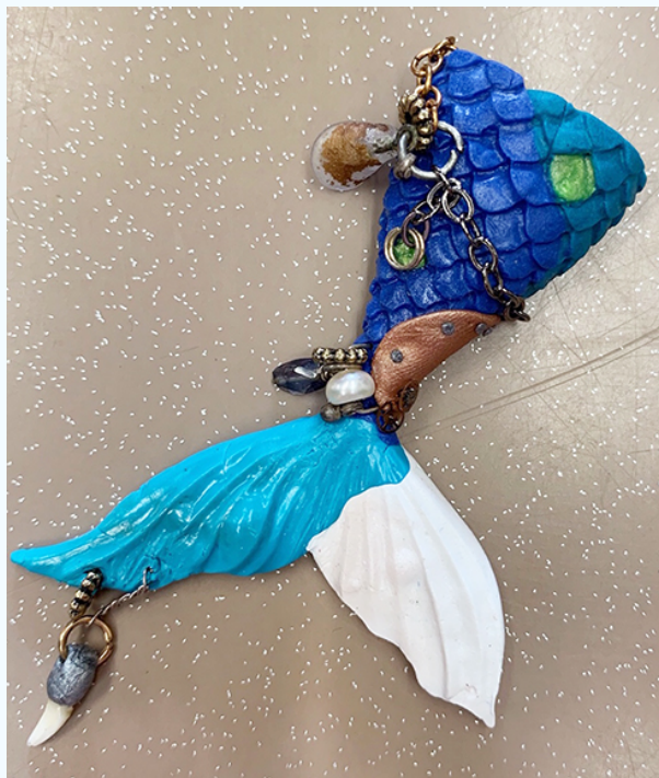
Work by Charlotte Day