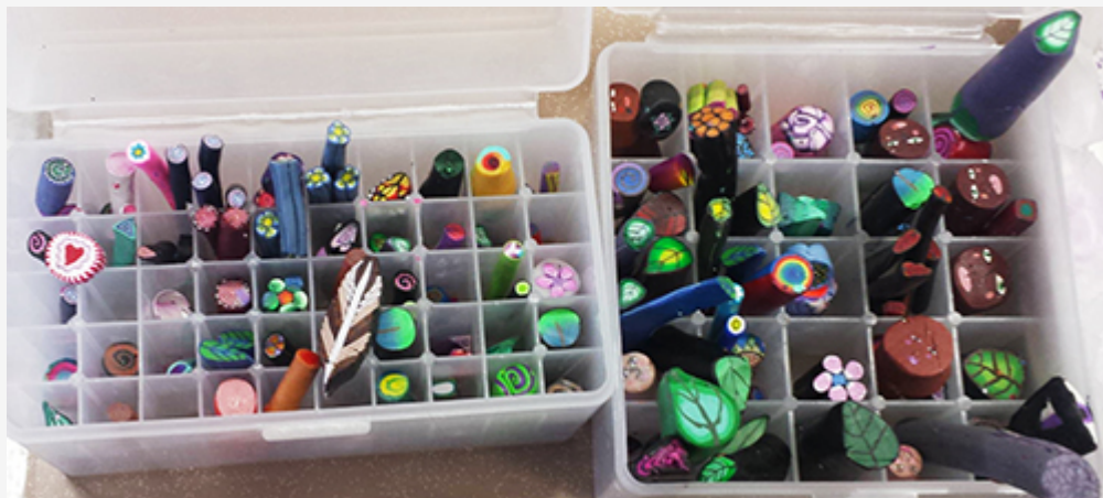
Cheryll Simmon's Canes