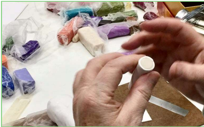
Transparent covered by white makes the base for a dainty lace cane