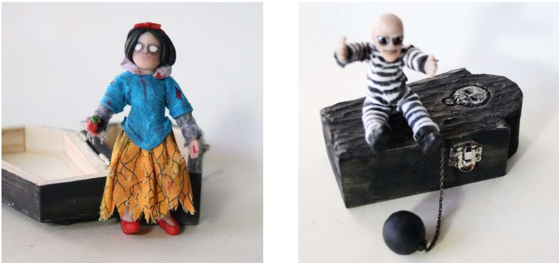
Miniature dolls by Ria Mendoza Hoyt