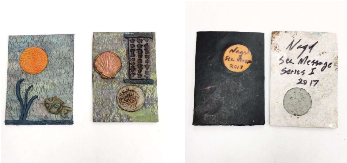
ATCs by Charlie Nagel (front and back)