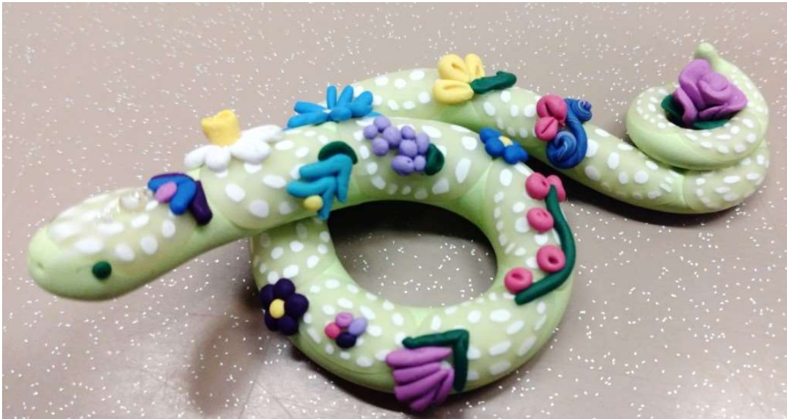
Snake