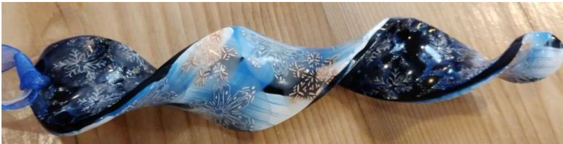
Snowflake ornament by Kim Day