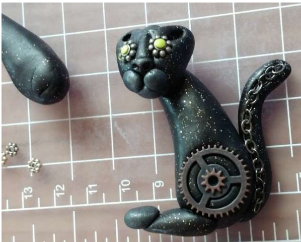
Patti Steele-Smith's work in progress