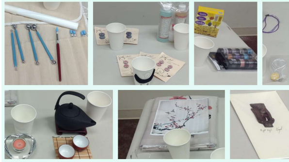
Raffle prizes were to die for!