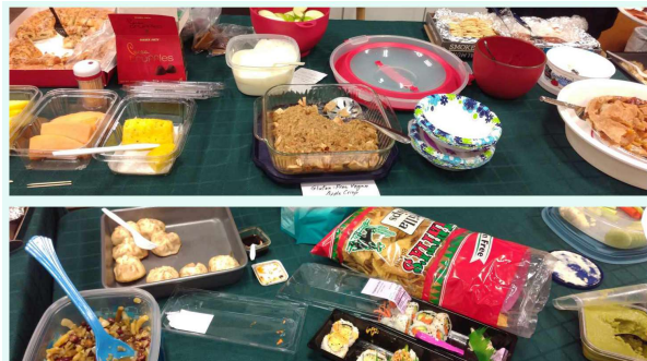
Food was a plenty