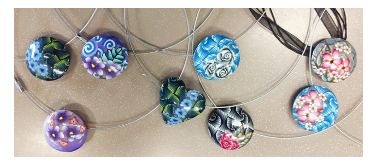
Pendants by Kim Day