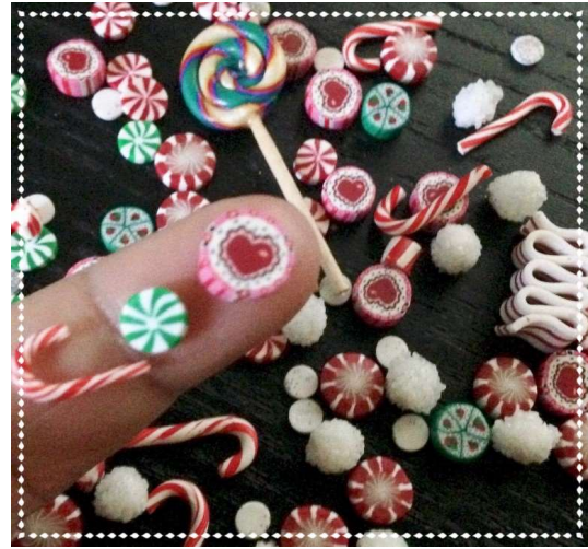
Miniature polymer clay candies made in previous years