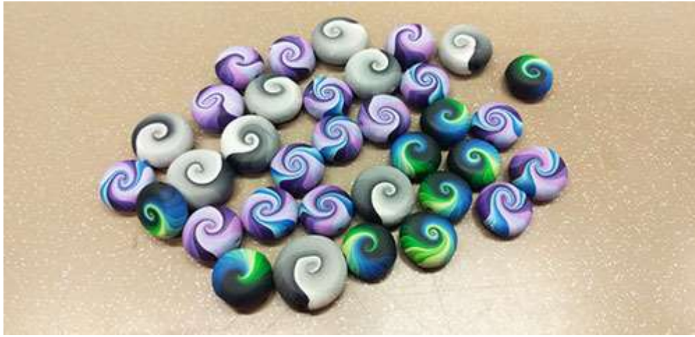
Swirly beads by Kim Day