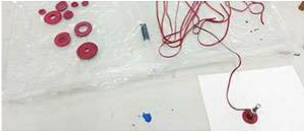
Kim Day worked on swirl beads.