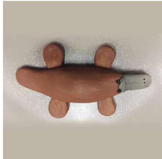
More platypus