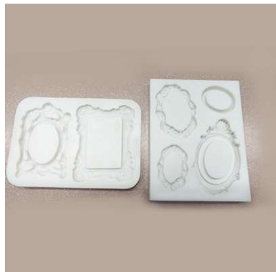
Gil Ledesma's supplies: (left) hummingbird and (right) picture frame molds