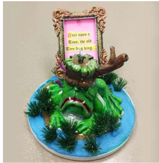
Left: Miniature garden by Patti Steele-Smith Right: The old tree frog king by Gil Ledesma