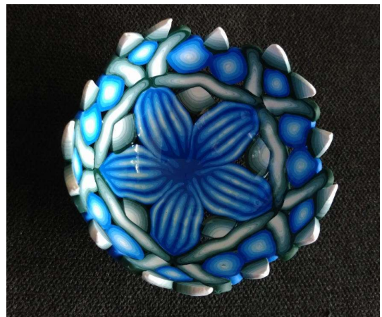
By Kim Day