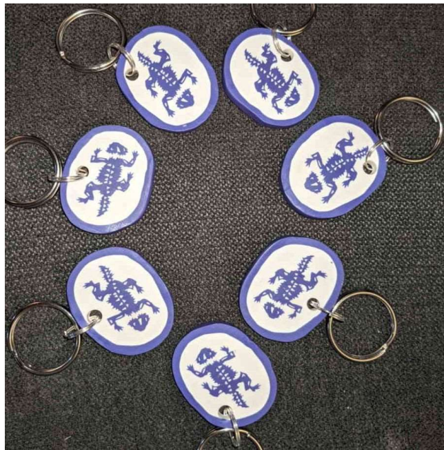
Horned toad keychains by Kim Day