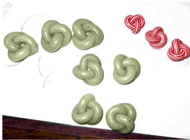
Earrings in progress by Kim Day