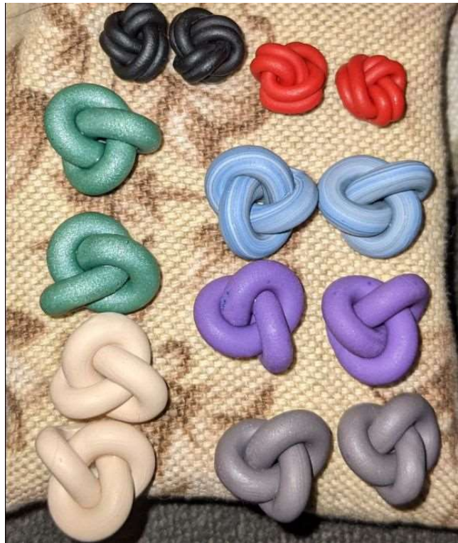
Earrings by Kim Day