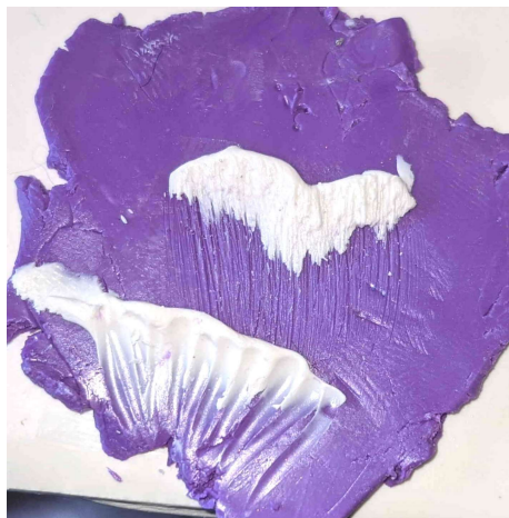
Textures with stylus and needle tool

With too much liquid clay, the mixture self levels and you do not get brush marks that stay in the clay.