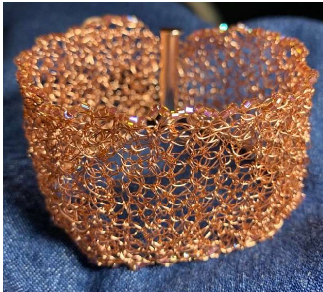
Crocheted wire cuff by Meredith Arnold