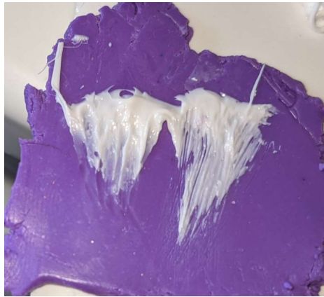
Using stiff brush to leave marks

still brush, or a toothbrush, and grab about halfway through your frosting stripe (inside/outside halfway, not side to side). Starting on the outsides, pull it down and in. You can pick a point towards the center that you're aiming for on all sides. This should leave a nice border on the outside, with gradually thinning lines of color towards the center.