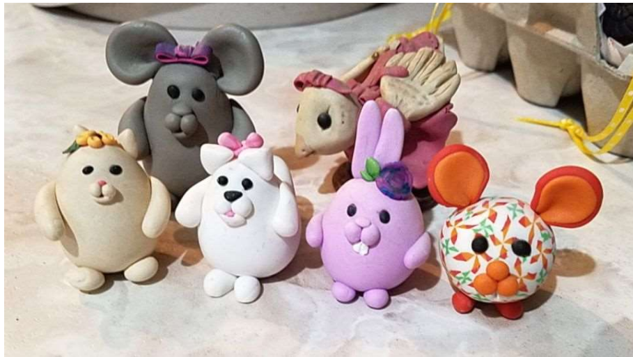
Old but newly-found creations by Cathy Gilbert