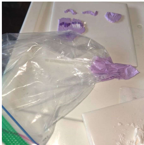
Clay in piping bag

Put it in a ziploc bag for piping. Turn the bag inside out, scoop the clay frosting into a corner, turn right side out. Cut a small hole in the corner.