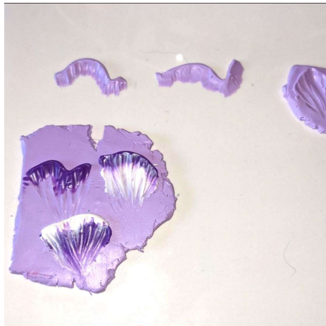
Embroidery with solid

With too stiff of a clay, you don't get a wonderful trail of color. Ball stylus worked well, and still a fun look, although not the one I was going for. If on unbaked clay, can also leave a fun texture.