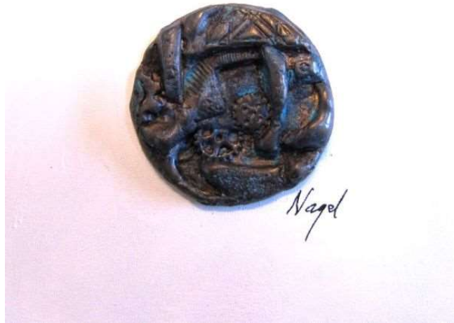
Time Pool II by Charles Nagel