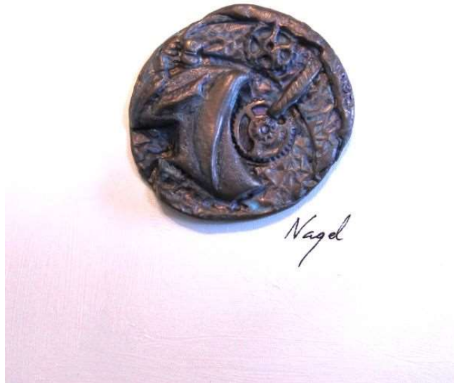
Time Pool V by Charles Nagel