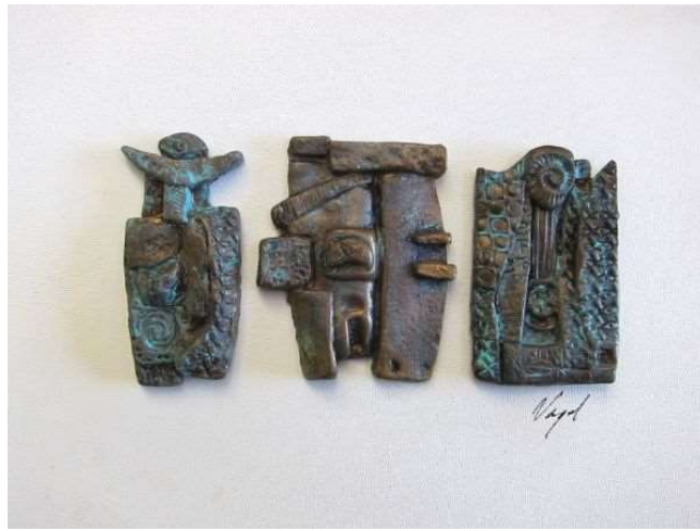
Triptych XIV - Oracle with Refuges by Charles Nagel