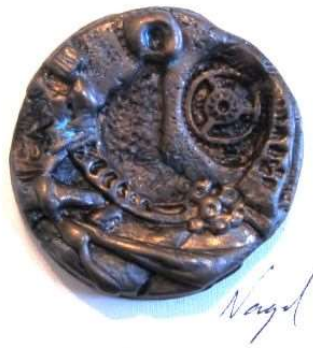
Time Pool I by Charles Nagel

When the waters on the beach recede to join the ocean, they leave behind tide pools, ecosystems that are exquisite small self-contained communities. When time recedes to rejoin the Universe, what traces might it leave behind?