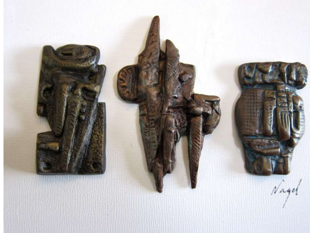
Triptych by Charlie Nagel

featured in the photo with your full name. As much as possible, do not crop the image. Each submission earns you a ticket to the year-ender party's raffle non-raffle.