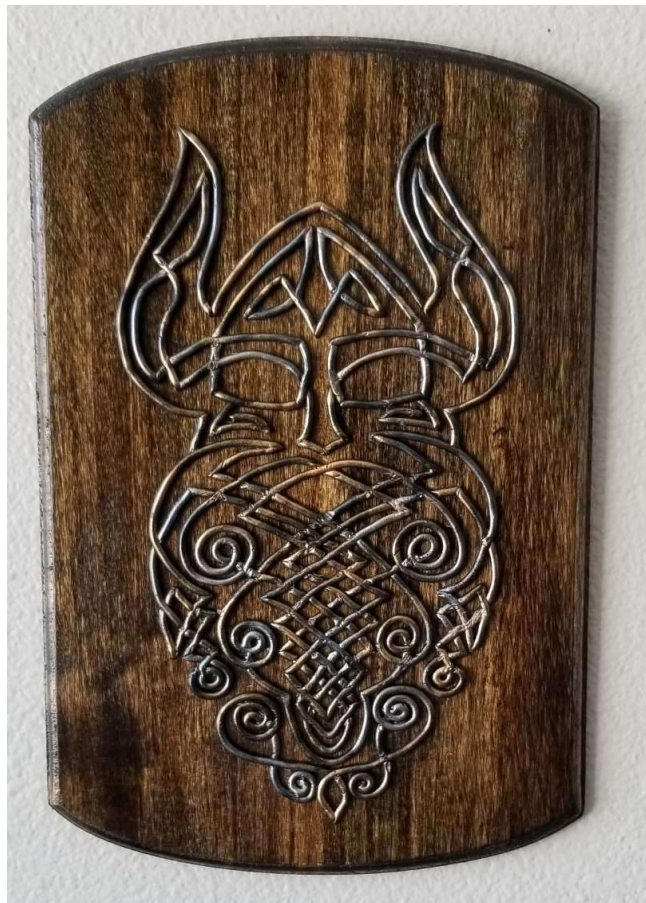
Celtic wall hanging by Shirley Henrichsen