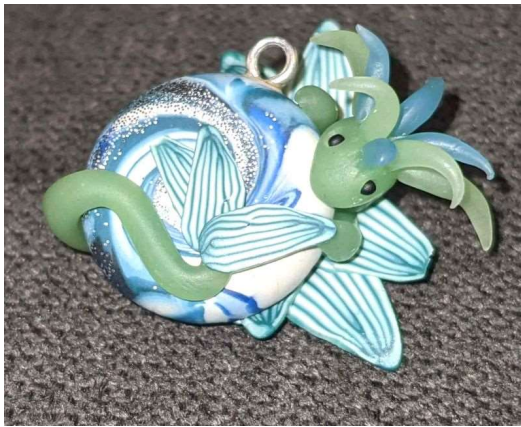
Mini dragon by Kim Day