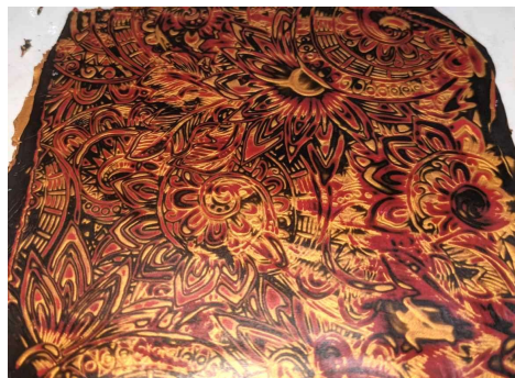
Mokume veneer by Kim Day