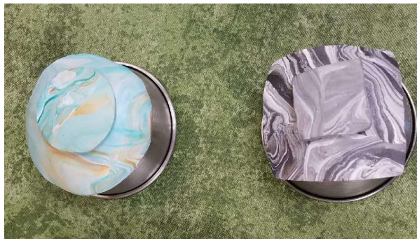
Cathy Gilbert's marbled bowl class: student work