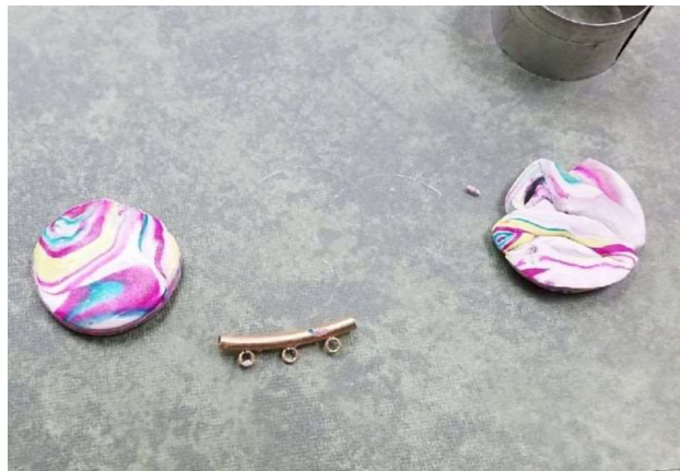
Cathy Gilbert's marbled bowl class: student work