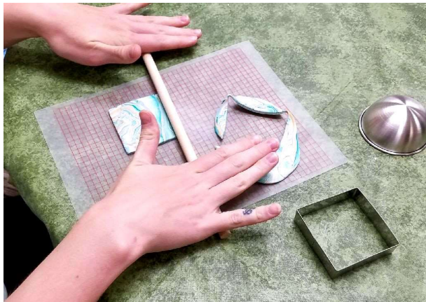
Cathy Gilbert's marbled bowl class: student work