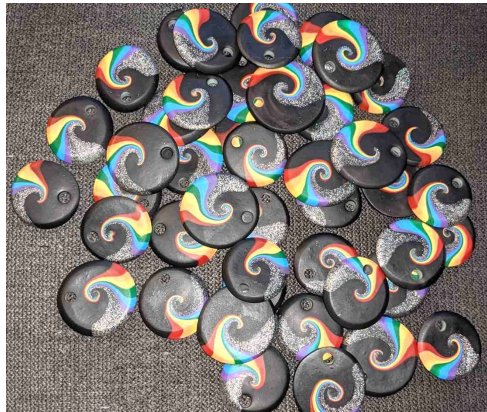
Rainbow swirls by Kim Day