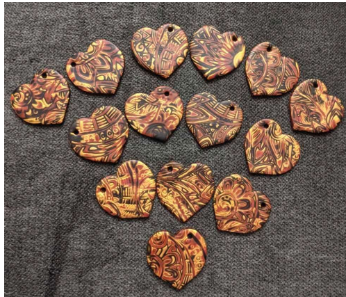
Mokume hearts by Kim Day