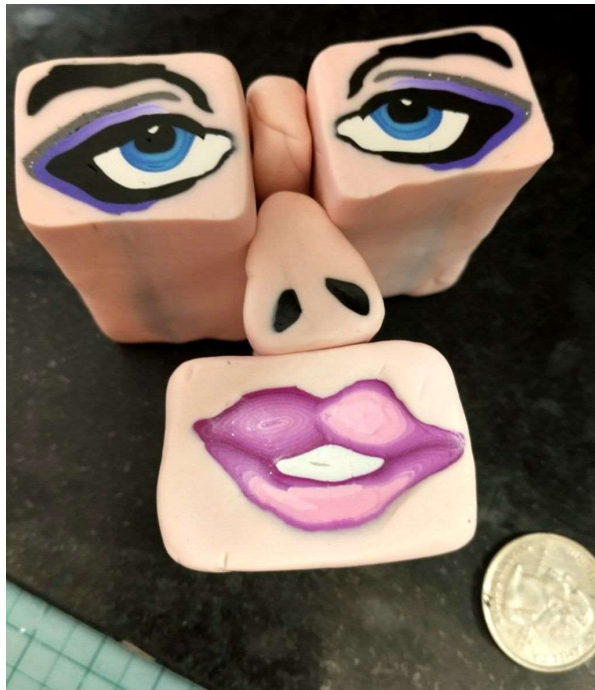
Face cane by Esther Schmidt