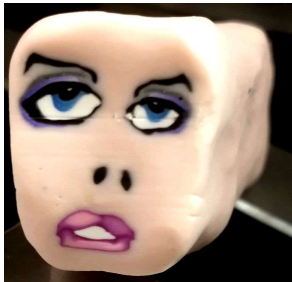
Face cane by Esther Schmidt