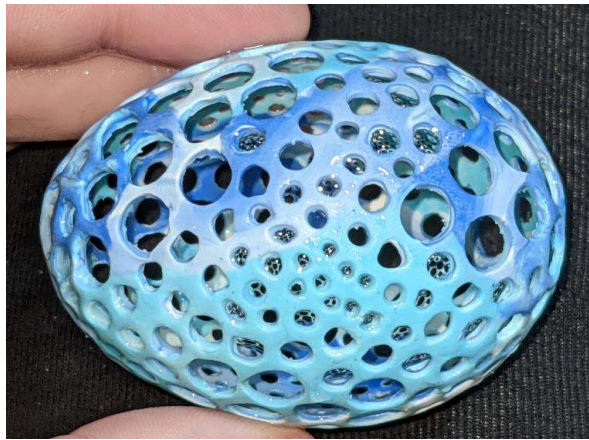
Vinegar egg ornament by Kim Day