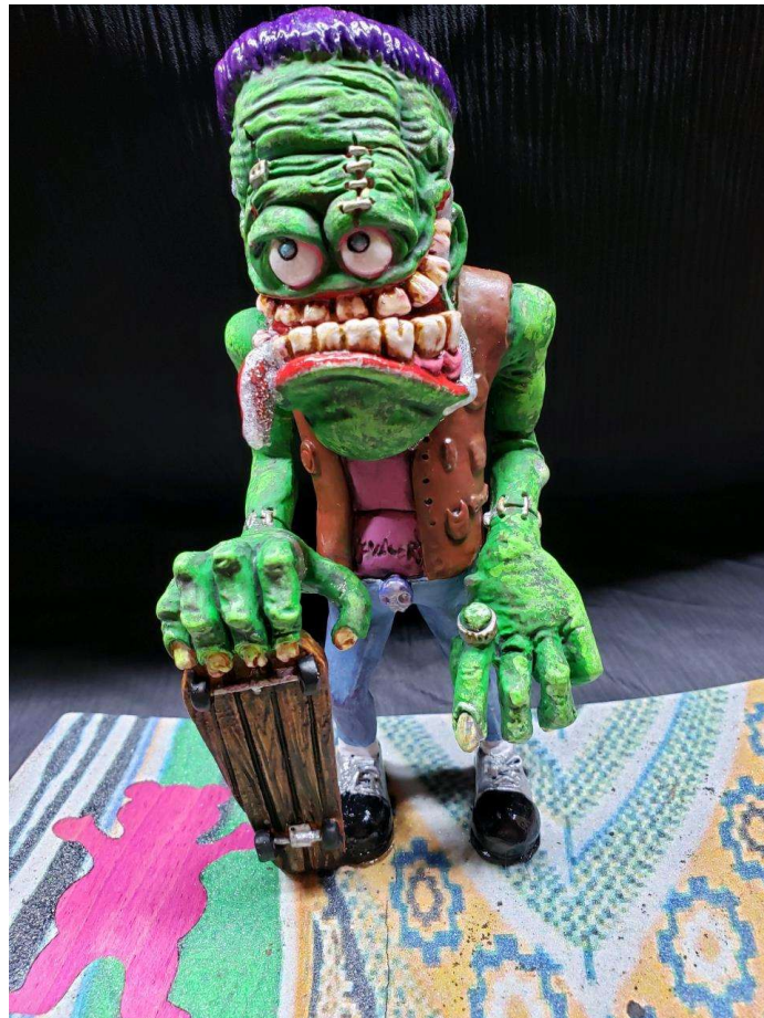
Resin and clay sculpture by Gil Ledesma