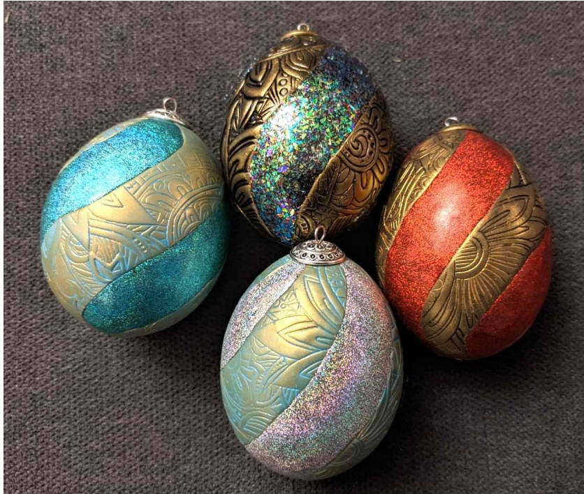
Ornaments by Kim Day