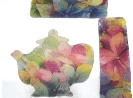
(L) Bead set and (R) napkin transfer by Cheryl Dixon