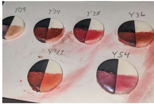
Work by Kim Day