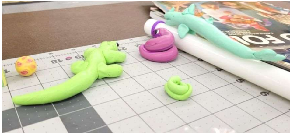
Work by Cathy's grandchildren