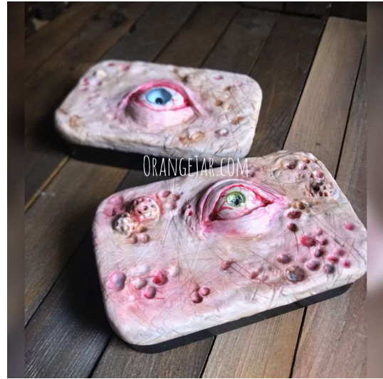
Work by Ria Mendoza Hoyt