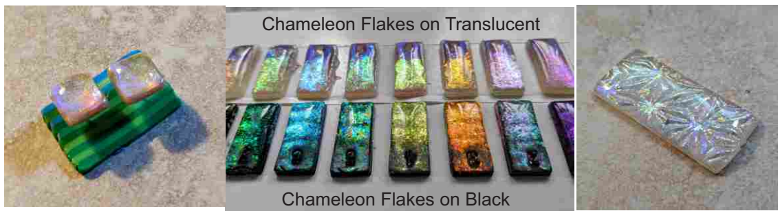
Chameleon Flakes on Translucent