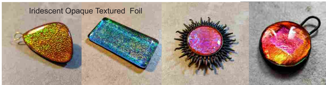
Iridescent Opaque Textured Foil