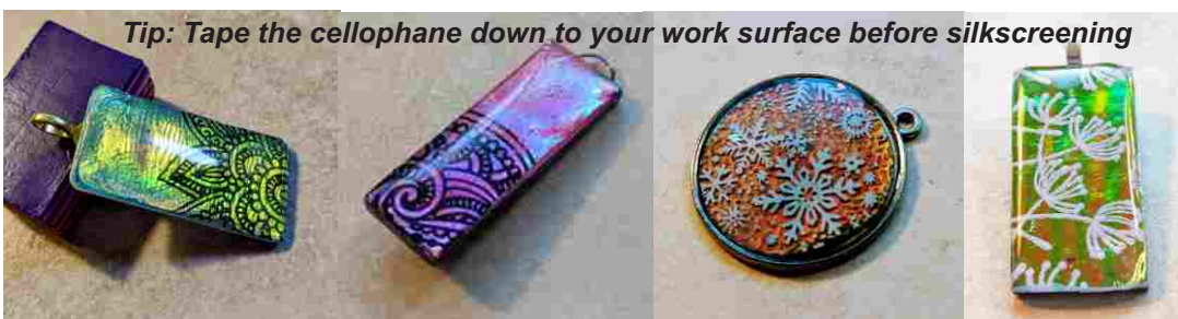
Tip: Tape the cellophane down to your work surface before silkscreening