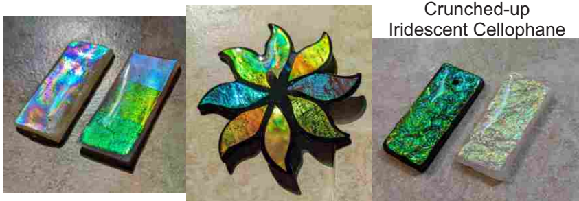
Crunched-up Iridescent Cellophane