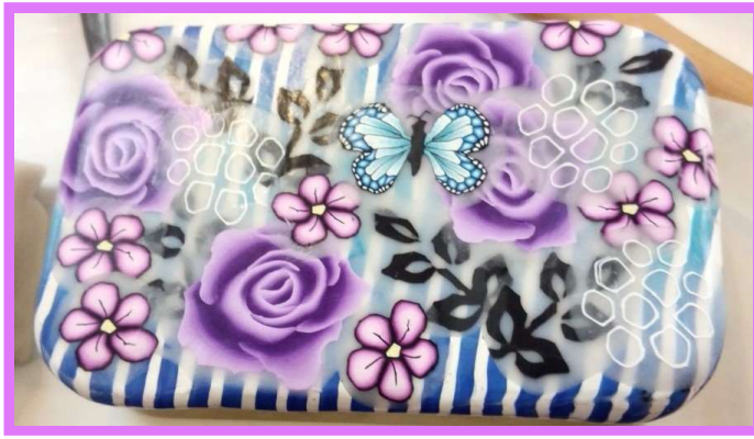
Polymer clay covered Altoid tins by Kim Day

We also had a great outreach exercise with a pair of ladies who took to polymer clay like ducks to water. If you haven't tried a Clay Day or just haven't been to one in a while, come and stop by. There is nothing quite so inspirational as watching others work on projects that make you want to try them too (looking at you Terri, I'm stealing that cane soon).