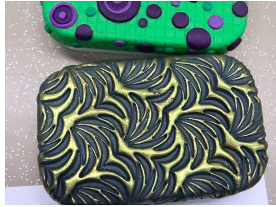
Polymer clay covered Altoid tins by Andrea Rivers