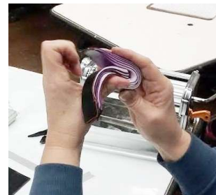
Tsunami cane demo by Kim Day