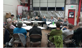
April 5 meeting