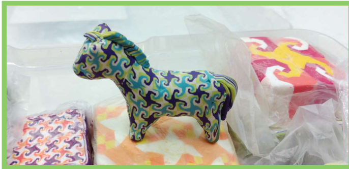
Snail trail cane-covered horse ornament by Cathy Gilbert

Cathy came super prepared to the round robin demonstration with a whole container full of samples and an awesome handout. She gave instructions on how to make different snails trails canes: two, three and four colors. Different people made different ones at the same time creating gorgeous canes – what a talented teacher! Pictures of the process will soon be up on her blog Catrinket , for those who missed this round robin session.