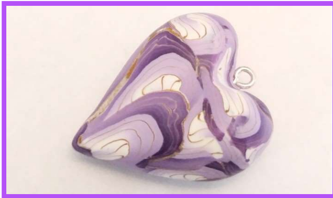
Hear-shaped ornament covered with Tsunami cane by Kim Day