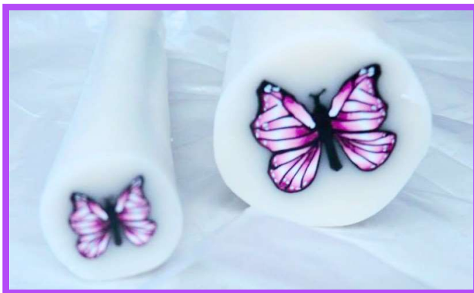
Kim Day worked on a butterfly polymer clay cane

Can I say how glad I am that the South Sound Clay Day in Enumclaw (or is that Enumclay?) doesn't start until 10:00? I'm a north sound