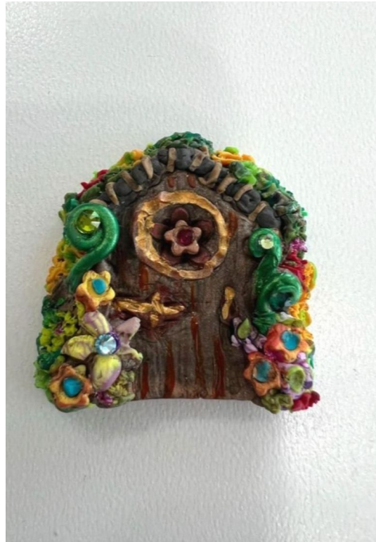
Work by Dawn Gray