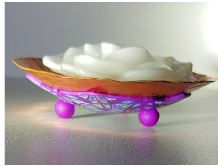
Work by Kim Day