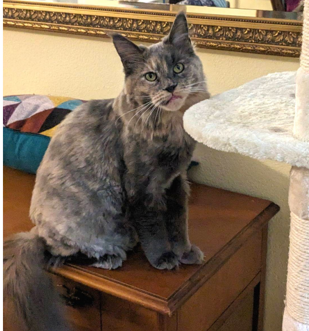
Work by Dawn Gray