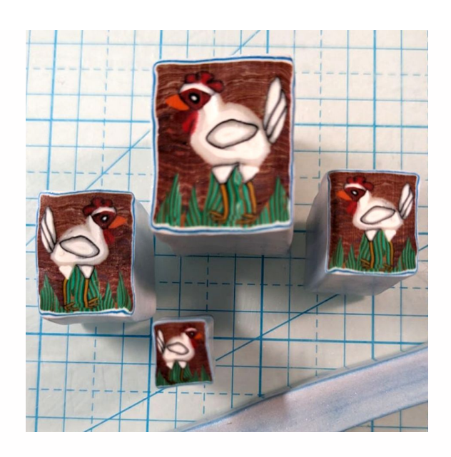
Work by Kim Day