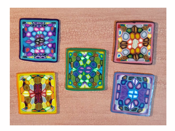
Work by Dawn Gray