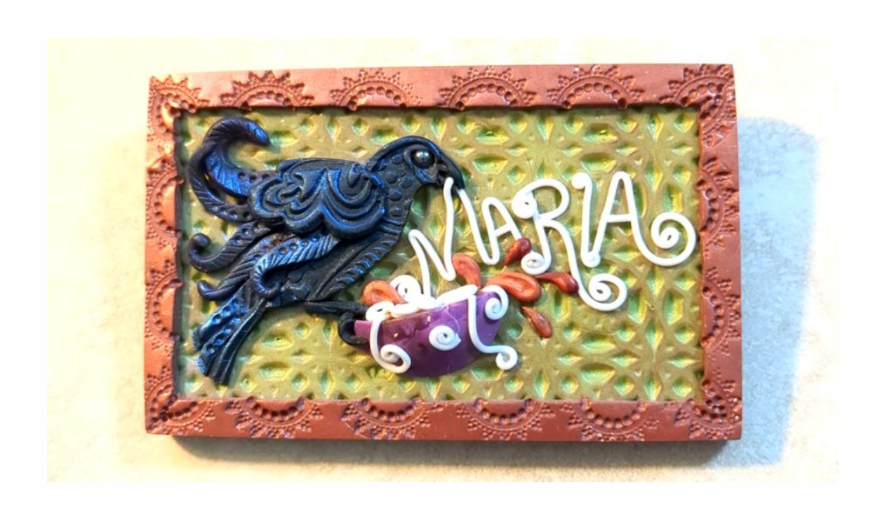
Work by Liz White